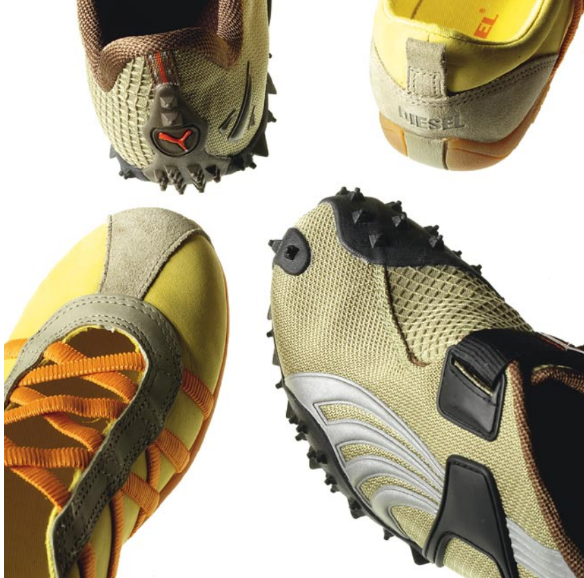
II NADIA WINZENRIED, CH

The great advantage of the FB version is its stretching technology (patent applied for). Using the practical crank on the back side of the giant umbrella, one person can almost effortlessly open up